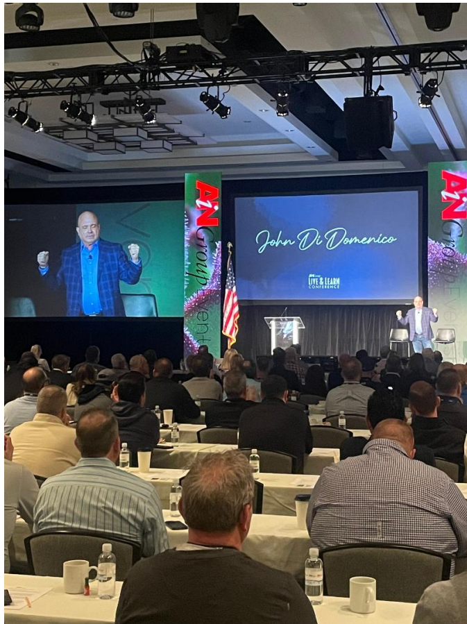
An AiN Live and Learn Conference Gallery